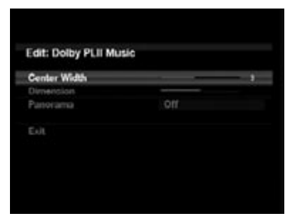
Figure 27 – Dolby Pro Logic II/IIx Music Mode Settings

Some additional settings are available for Dolby modes. When the Dolby Pro Logic II or IIx Music modes have been selected, choose the Edit submenu to adjust the Center Width, Dimension and Panorama settings. See Figure 27.